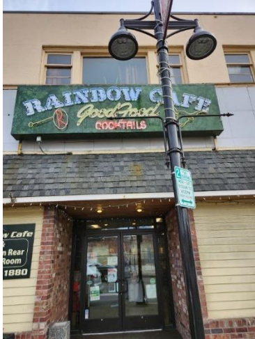
112 E. Main St. Auburn, WA. 98002