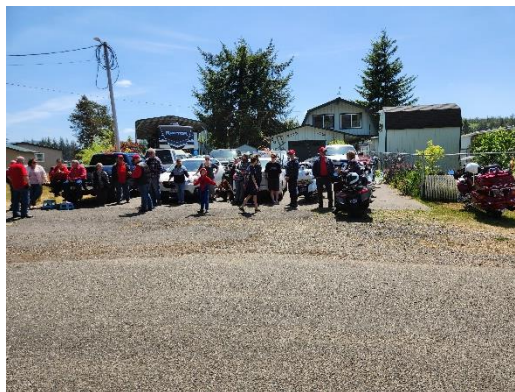
A very nice Surprise party for Todd