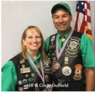
Looking through the Windshield