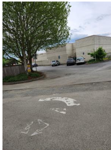
Lots of Parking in back of Rainbow Cafe

(Have you checked out the Chapter "A" Website lately? Our Webmaster works on it almost daily, Check it out). gwta-waa.com Come on out and join in!