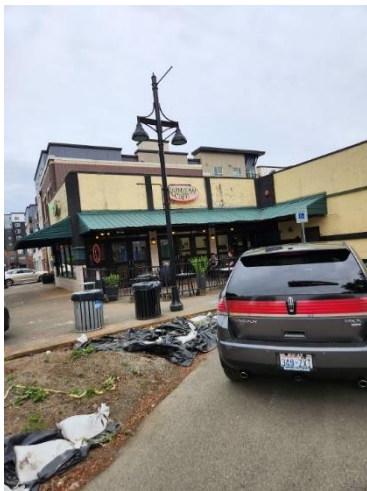
Rear entrance to Rainbow Café!